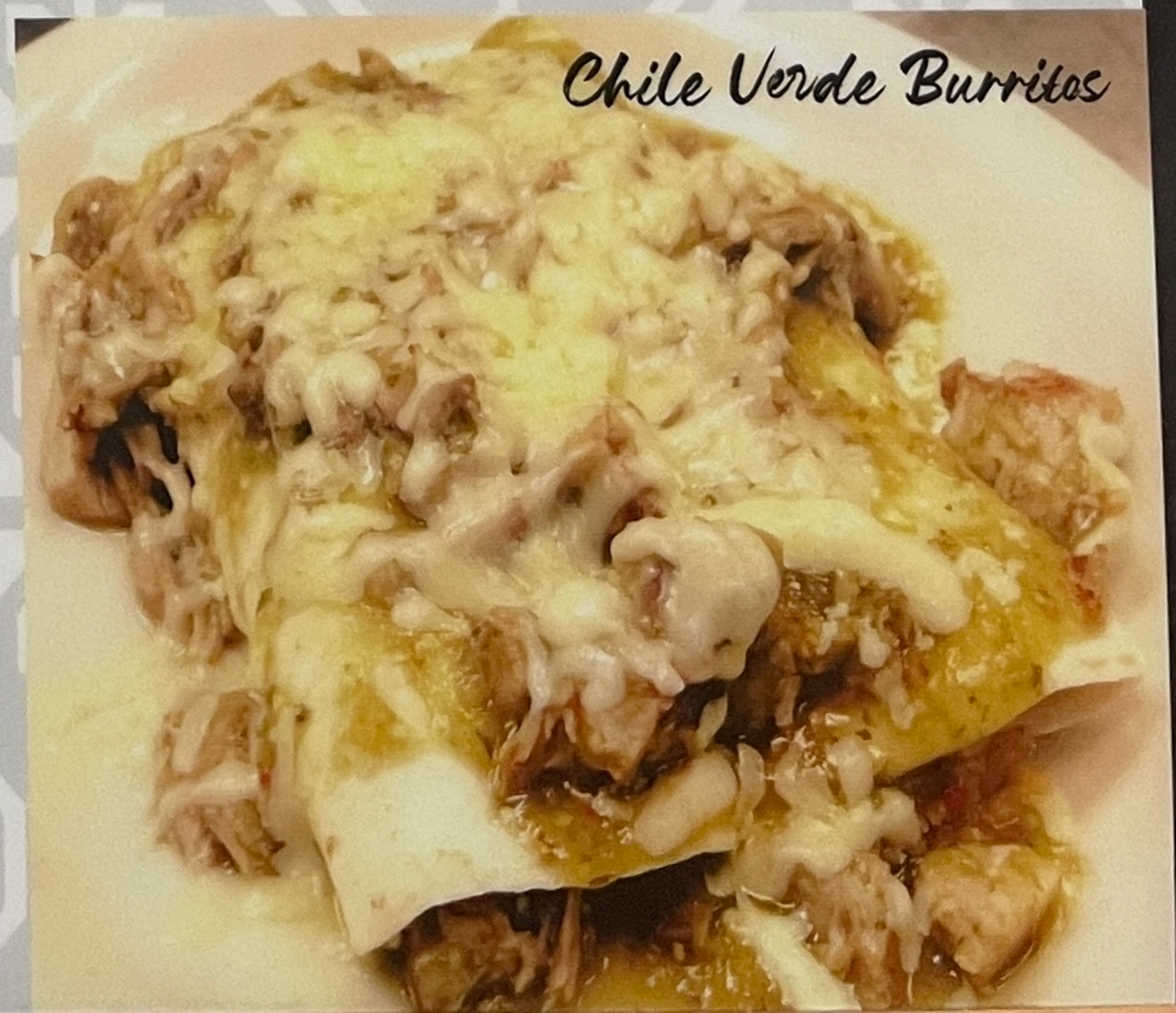
Chile Verde Burritos

A big flour tortilla burrito filled with grilled chicken and our homemade chorizo (Mexican sausage). Topped with cheese sauce served with rice, lettuce, tomato, cheese and sour cream.