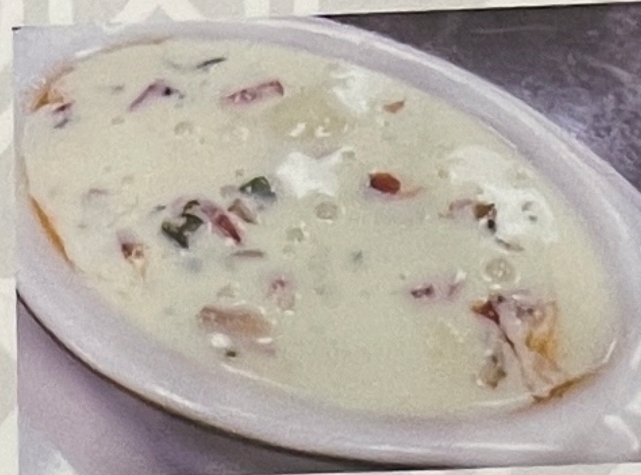
Pico Cheese Dip